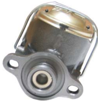
Deep Pocket Illustration

Note: Make certain that you have a deep pocket master cylinder. Make absolutely certain there is no plug in the back of the master cylinder and that you have a hole approximately 1" to 1 ¼" deep in the back of the master. See picture below.