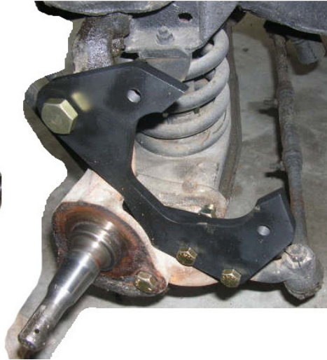
Driver's Side, Side View