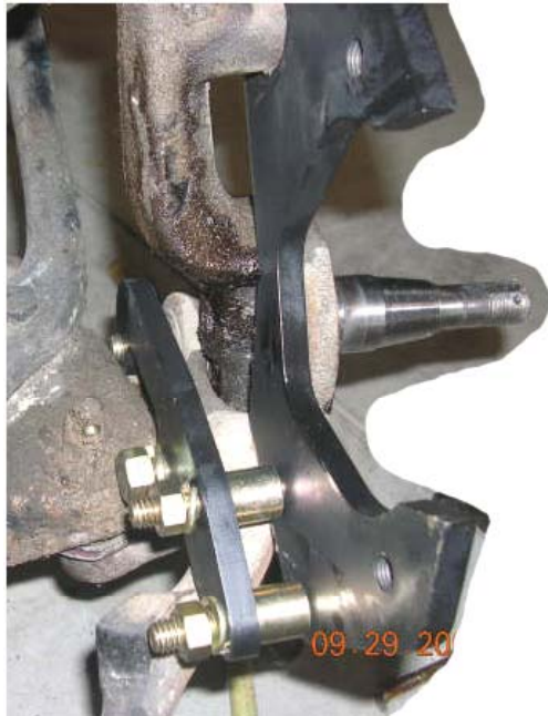
Passenger's Side, Rear View