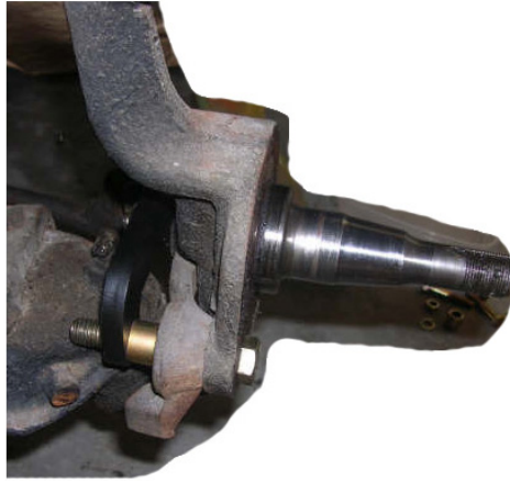
Driver's Side, Front View