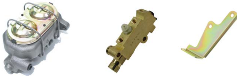
DBMC09, PV71 & PVB71 Pictured (Booster, master cylinder & valve setups may vary by upgrades selected)

Your new disc brake conversion kit can be bolted up with standard hand tools. The only tools you may not find in your toolbox are listed below.