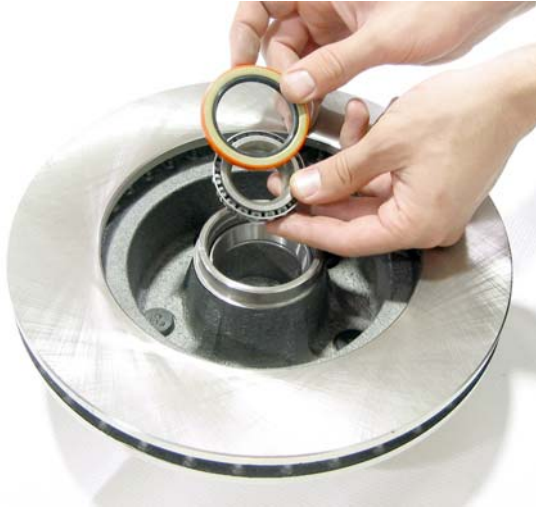
Inner Bearing Assembly

You are now ready to install the bearings and rotor. Start by placing the rotor face down. Races come preinstalled in the rotors. If you received additional races with your bearings, they will not be used. Apply a little bearing grease to the bearing race already in the rotor and pack the larger of the two bearings (Inner) with grease. Install the bearing into the rotor and place the grease seal on the rotor. Tap the seal into place being careful not to damage the rubber portion of the seal.