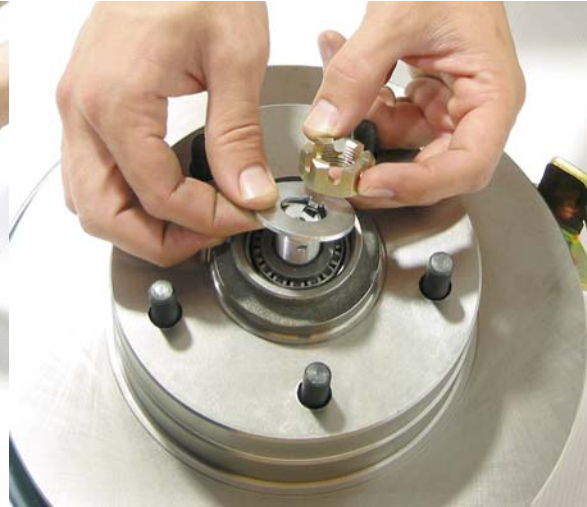
Outer Bearing Assembly

Note: Your conversion comes with two different castle nuts and two different grease seals. You only use the one set that is applicable to your car. Start by trying the black grease seal and short castle nut. If those do not work, use the other set provided.