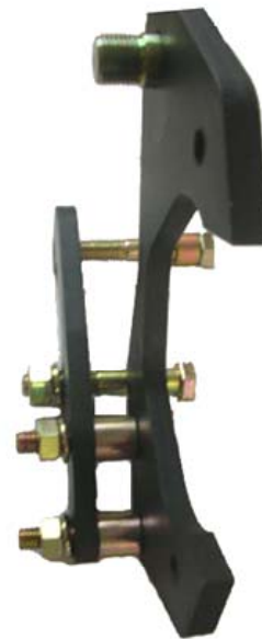
Passenger's Side, Rear View Off Of Car

Join the two brackets together using the \frac{3}{4} " spacers and the 2\frac{1}{2} " bolts provided in the kit. Tilt the main bracket up until the two holes in the lower corner match up with the two remaining holes in the support bracket. Insert the spacer between the two brackets and bolt them together using the aforementioned hardware. Torque the \frac{5}{8} " main spindle bolt using GM's factory torque specs for that bolt and then torque the two bolts that join the main bracket to the support bracket to roughly 50-60 ftlbs. With your hand move the spindle back and forth simulating the wheel turning. If necessary trim the excess threads off of the back of the forward steering arm bolt (the bolt without lock washer and nut) for control arm clearance.